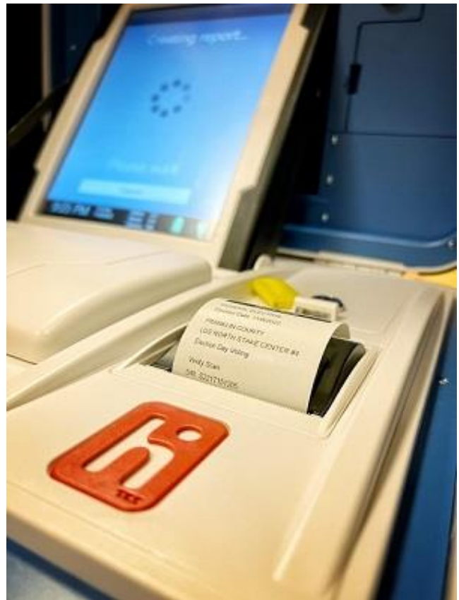
Figure 2: Hart InterCivic Verity scanner printing confirmation code

The use of multiple people acting as guardians to oversee the key and tally generation is a core security feature of ElectionGuard.