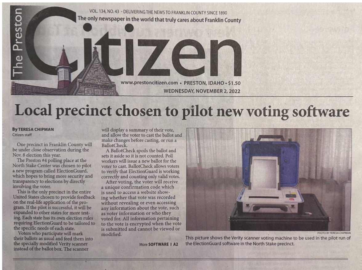
Figure 1. Franklin County newspaper article alerting Preston voters to changes in this year's election process

There was also a front-page article in the local paper, The Preston Citizen (see below). This outreach to voters in advance of the election was important. Most voters came to the polling place aware of the changes taking place, having read the mailing or news article, or both.