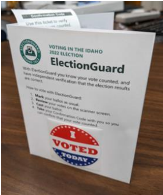
Figure 5: The handout, showing a confirmation code tucked in the inside pocket.

CCD also created a handout for voters to hold their confirmation code and take with them after voting. This had some design challenges, as it needed a pocket-sized format and, if it was not compelling in its design, voters would simply toss out the handout before leaving the polling place.