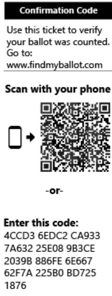
Figure 4: Sample confirmation code generated by Hart InterCivic Verity scanner

Although challenged ballots are not included in the final published tally, they are released along with the election record. The same confirmation-code lookup site used by voters to determine that their ballots were included with the tally is also used to show the contents of decrypted challenge ballots.