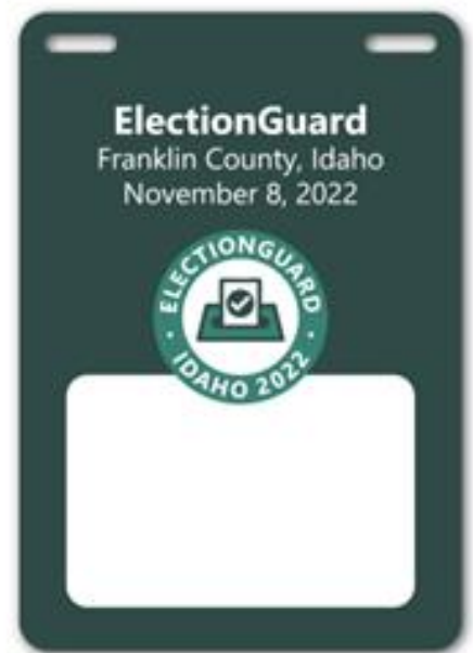
Figure 6: A name badge for the ElectionGuard on-site team, using the colors and logo

After some experimentation and consultation with Idaho and Franklin County, they decided to avoid using language that suggested that the election was a “pilot” because it suggested that the ballots were not real ballots being cast in a real election.