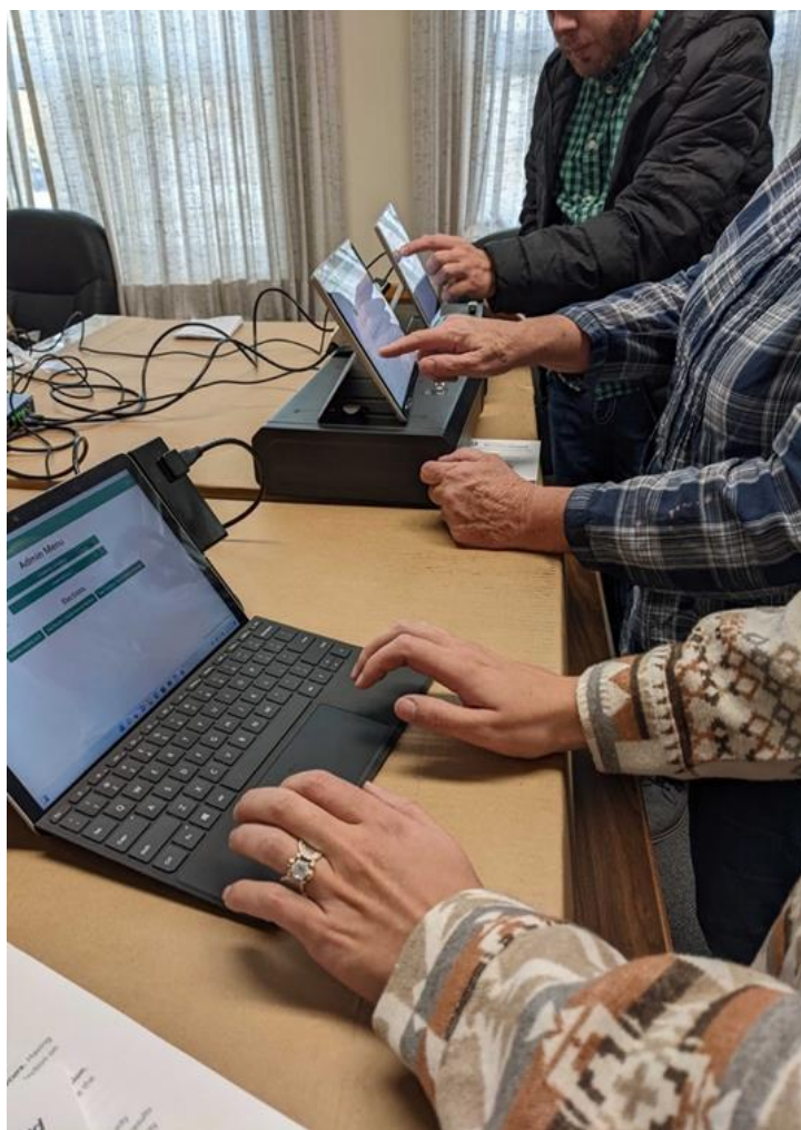
Figure 3: Guardians and administrator performing key ceremony to generate software package used by Hart InterCivic precinct scanner to encrypt ballots during election

The keys allow encrypted ballots and results to be made available to the public in encrypted form, while maintaining ballot secrecy. Guardians are analogous in function to election canvassing boards: respected individuals in the community that lend independent scrutiny and oversight to election processes. They are independent actors who work together to create the cryptographic keys used to both encrypt ballots and generate the final tally and public election record. The key and tally ceremonies can be observed by the general public, adding to the transparency of the technical processes.